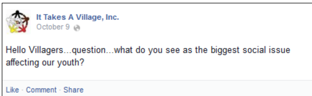
Figure 2. Example of social media post using a question.

This post presents a current perspective, opening dialogue, and integrates well with the mission of the nonprofit to improve children’s lives. It is a successful example of social media content.