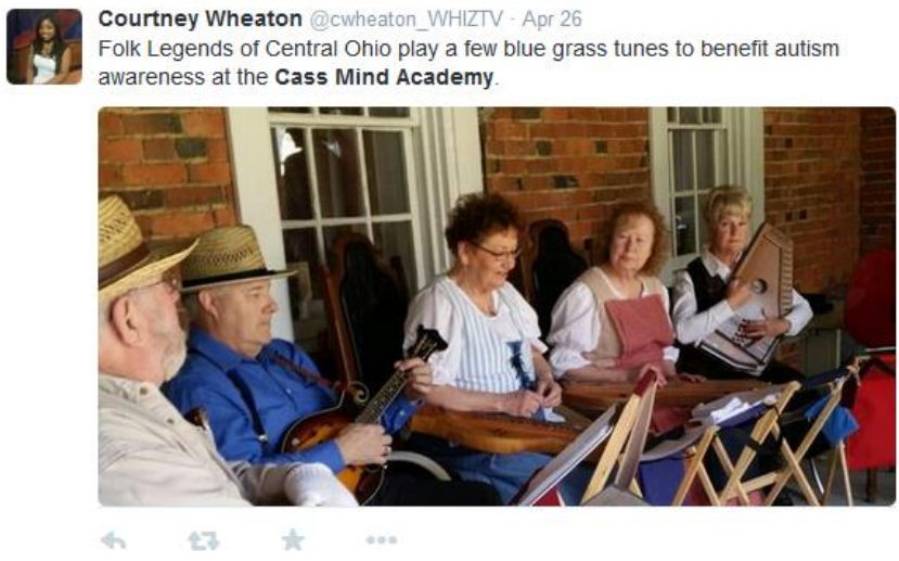
Figure 3. A post to Twitter or "tweet" of a nonprofit organization event.

The inclusion of a photo adds a visual element to the post. This post is also a good example of connecting with current news events. Figure 4 demonstrates a message integrating two social media by CASS-MIND Academy.