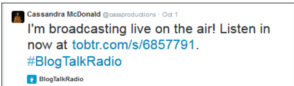
Figure 4. A post to Twitter integrating social media.