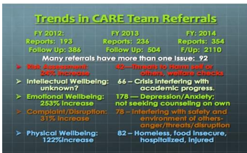
Chart prepared by the UAA CARE team, 2014.

Institutions of higher learning and accrediting bodies have a real interest in promoting student success, retention, and graduation rates. Increasing trauma awareness and trauma informed advising skills among academic advisors will assist in promoting student success and reducing the possibility of violence on college and university campuses.